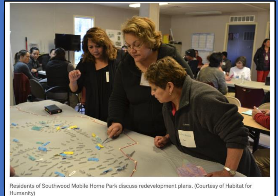
Residents of Southwood Mobile Home Park discuss redevelopment plans.